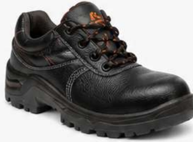
SAFETY SHOES (Single Density PU sole)

CE EN ISO 20344:2011 EN ISO 20345:2011 EN 61340-5-1:2016 Electrostatic