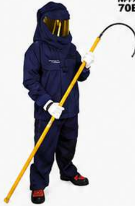
12 CAL ARC FLASH KIT