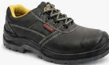
EXTRA LIGHT WEIGHT, LOW CUT LACED SHOE