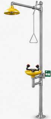
SAFETY SHOWER (SS/GI)