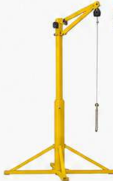
OVERHEAD ROTATIONAL BOOM ANCHOR