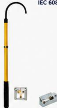
INSULATED RESCUE HOOK