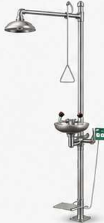
SAFETY SHOWER (FOOT PEDAL)