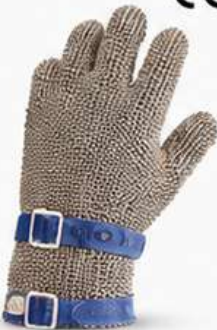
STAINLESS STEEL MESH GLOVE

CE ANSI/ISEA 105 2016 A5 Cut Level 2 EN 388:2016 4X42E