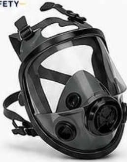
FULL FACE PIECE REUSABLE AIR PURIFYING RESPIRATOR