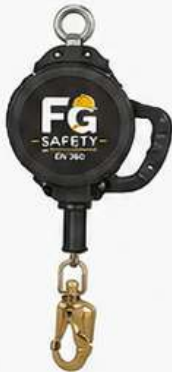
RETRACTABLE FALL ARRESTER BLOCK