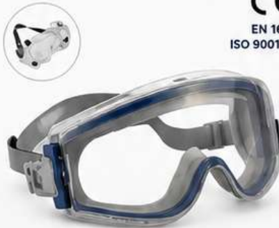
ANTI-FOG COATING GOGGLES