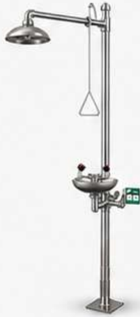
SAFETY SHOWER (SS/GI)