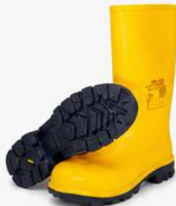
CLASS-2 DIELECTRIC BOOTS

ELEC. HAZARD 18 kV COMPOSITE TOE CAP 40 JOULES IMPACT RESISTANT