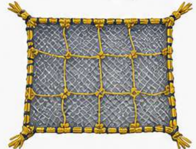
DOUBLE LAYER SAFETY NET