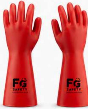
CHEMICAL PROTECTION GLOVES