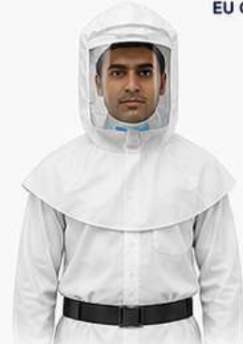
GRIDEL AIR HOOD