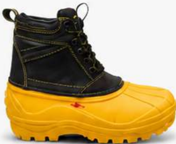
DIELECTRIC SAFETY SHOES

EN ISO 20345:2011 SBP SRC (Category-vi rated) (Foot tested at 10 kV)