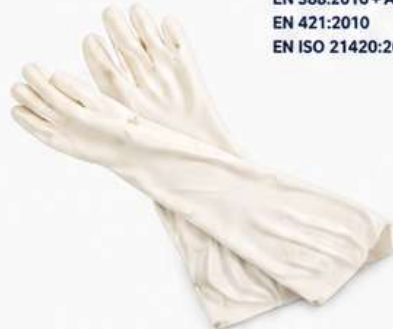
GLOVEBOX GLOVES (HYPALON)

CE EN ISO 374-1:2016 EN ISO 374-5:2016 EN 388:2016 + A1:2018 EN 421:2010 EN ISO 21420:2020