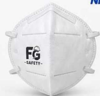
N95 PARTICULATE RESPIRATORS