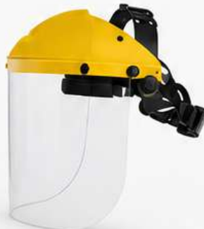
FACE SHIELD WITH FRONT PROTECTION