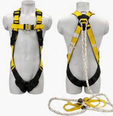
FULL BODY HARNESS