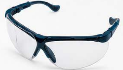
CLEAR FOG BAN EYEWEAR