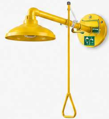
WALL MOUNTED SHOWER