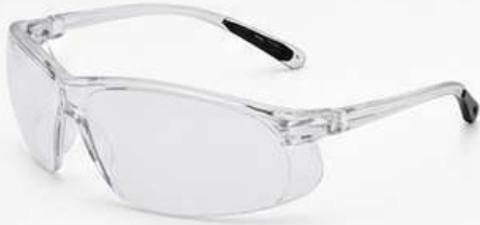
ANTI FOG, ANTI SCRATCH POLYCARBONATE EYEWEAR