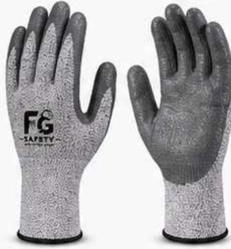
OIL GRIP GLOVES

ANSI CE EN 388:2016 EN ISO 21420:2020 ANSI/ISEA 105:2016