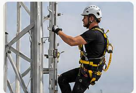
FALL ARREST SYSTEM ON RIGID CABLE