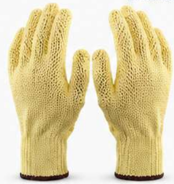
HEAT RESISTANCE GLOVES