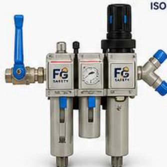
AIR FILTRATION UNIT