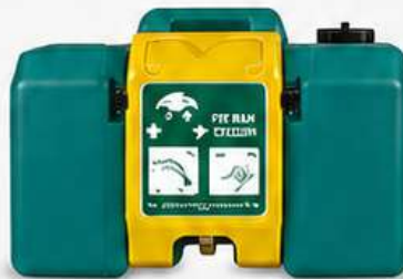
PORTABLE EYE WASH UNIT