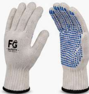
POLKA DOTTED KNITTED GLOVES

CE EN 420:2003+A1:2009 EN 388:2016 + A1:2018