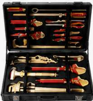
NON SPARKING TOOL KIT