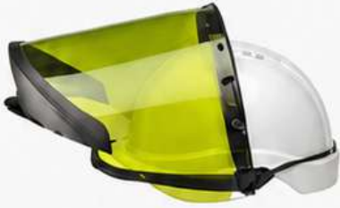
ARC RATED HELMET WITH VISOR