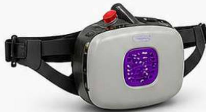
POWERED AIR PURIFYING RESPIRATOR (PAPR)