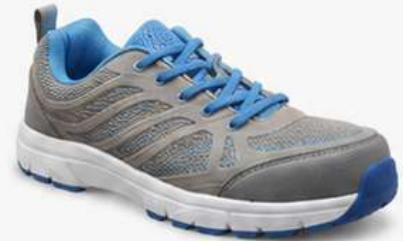
SPORTS SAFETY SHOES (Light Blue and Grey)

EN ISO 20345:2011 SBP SRC (Category-vi rated) (Foot tested at 10 kV)