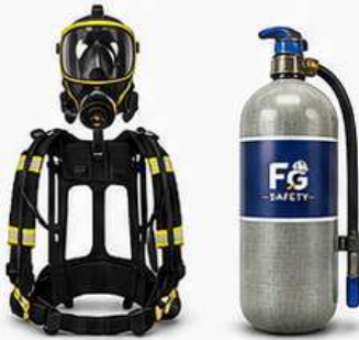
SELF CONTAINED BREATHING APPARATUS (SCBA)

EN137:2006 / EN145:2004 EN12245 CO CE (PESO)