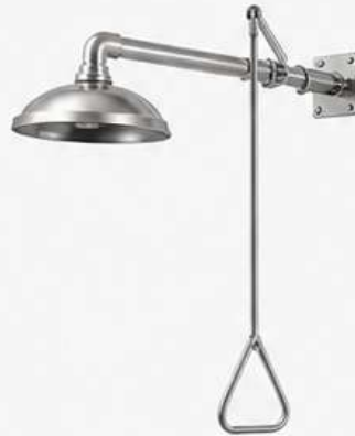
WALL MOUNTED SHOWER