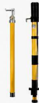
EXTERNAL ROD CLAMP STICKS