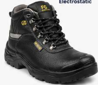
ESD SAFETY SHOES (Electrostatic Discharge)

CE EN ISO 20344:2011 EN ISO 20345:2011 EN 61340-5-1:2016 Electrostatic