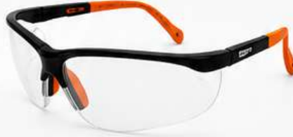
HARD COATED, ANTI-FOG EYEWEAR