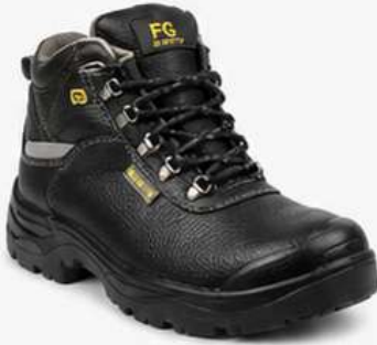
SAFETY SHOES (Double Density PU sole)