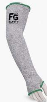
CUT LEVEL D SLEEVE