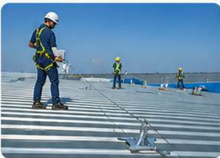
FALL ARREST SYSTEM FOR ROOF