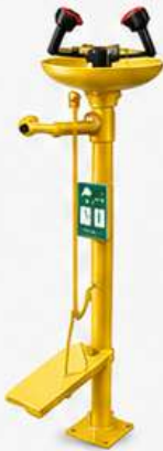
FACE WASH FOUNTAIN (SS/GI)