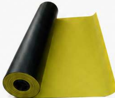
INSULATING RUBBER MAT (CLASS 00, 0, 1, 2, 3 & 4)