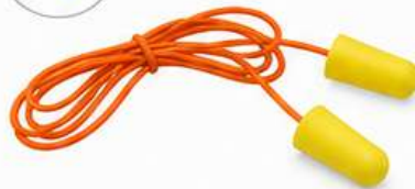
CORDED FOAM EARPLUG