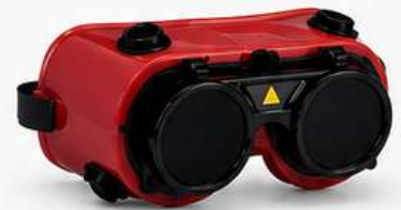
GAS & WELDING GOGGLES