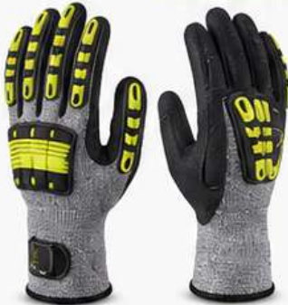
IMPACT RESISTANCE GLOVES

ANSI CE EN ISO 21420:2020 EN 138:2016 + A1:2018 ANSI/ISEA 138:2019