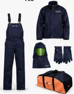
45 CAL ARC FLASH KIT