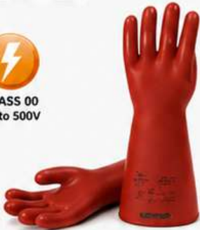
ELECTRICAL INSULATING GLOVES (CLASS 00, 0, 1, 2, 3 & 4)