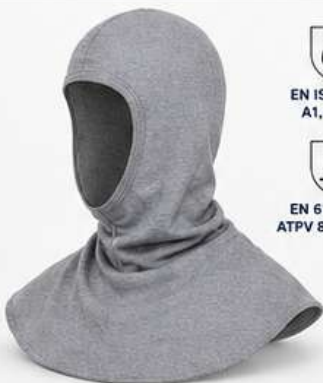
ARC FLASH FR BALACLAVA