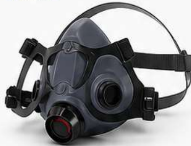
HALF FACE PIECE REUSABLE AIR PURIFYING RESPIRATOR