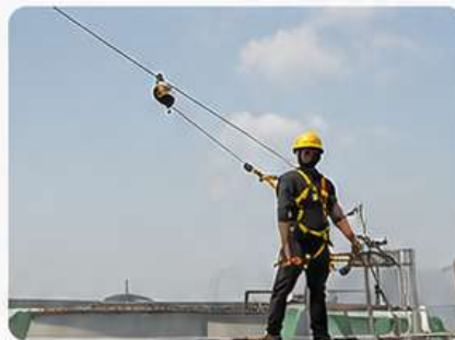
FALL ARREST SYSTEM OVER THE HEAD