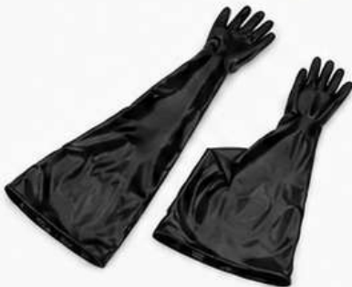
GLOVEBOX GLOVES (BUTYL)

CE EN ISO 374-1:2016 EN ISO 374-5:2016 EN 388:2016 + A1:2018 EN 421:2010 EN ISO 21420:2020