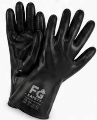
CHEMICAL RESISTANT GLOVES