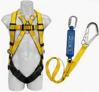
FULL BODY HARNESS WITH ENERGY ABSORBER