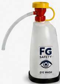
EYE WASH BOTTLE