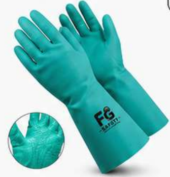
NITRILE RUBBER GLOVES