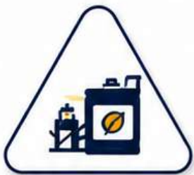
Fertilizers & Pesticides