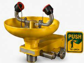
WALL MOUNTED EYE WASH