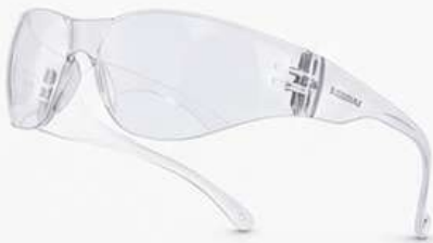
ANTI FOG SAFETY EYEWEAR