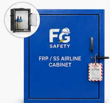
FRP / SS AIRLINE CABINET