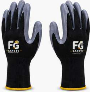
NITRILE COATED GLOVES

ANSI CE EN 388:2016 EN ISO 21420:2020 ANSI/ISEA 105:2016