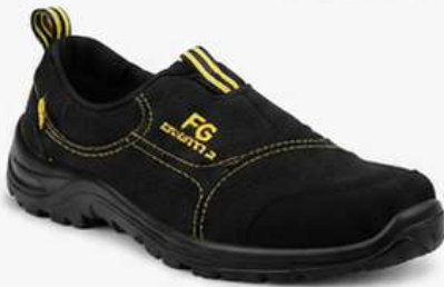
POLYESTER COTTON ESD SHOES (Electrostatic Discharge)