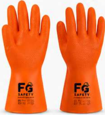
CHEMICAL RESISTANT GLOVES

CE EN 388:2016 EN 407:2020 EN 374-1:2016