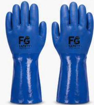
PVC DOUBLE DIPPED GLOVES

CE EN ISO 21420:2020 EN ISO 374-5:2016 EN 388:2016+A1:2018